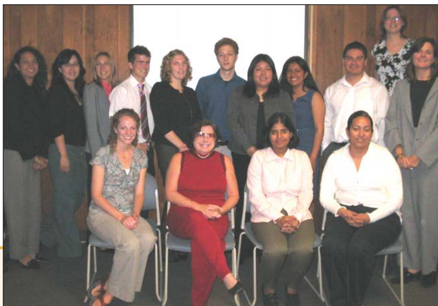
UCI and Santa Ana College students present findings to City officials and housing groups

Street declined dramatically after the renovation, and residents felt that the area was now much safer for children and adults. This project provided a valuable opportunity for students from the two schools to learn from each other, and from the community. Also, we are proud to announce that one of the Santa Ana College students has joined UCI as a new student this fall!